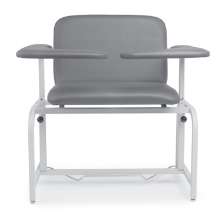
620 Blood-Draw / Phlebotomy Chair

The Blood-Draw / Phlebotomy Chair is intended as a medical-room chair where a patient can sit comfortably to allow medical personnel to draw blood.