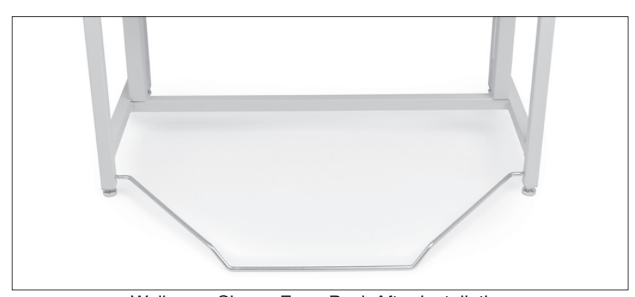
Wallsaver Shown From Back After Installation